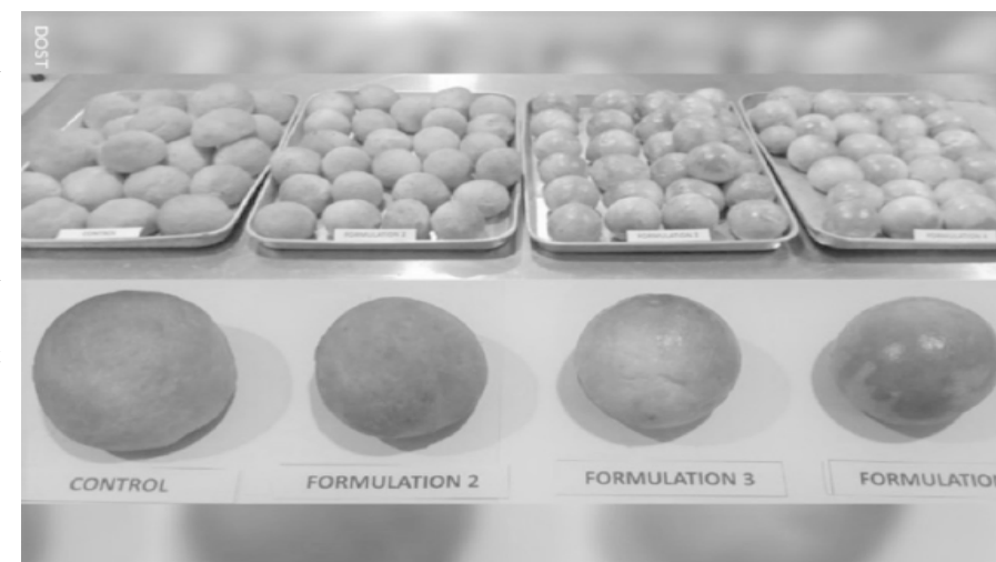
The enhanced nutribun is not only good for young children, but also for the other population groups, particularly, pregnant and lactating women, and senior citizens.